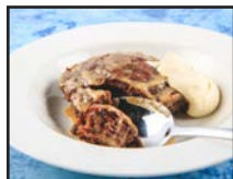
114-03 Sticky Date Pudding