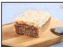
114-30 Banana Cake