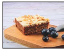
114-28 Carrot Cake