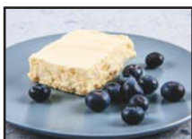
114-16 Baked Cheesecake