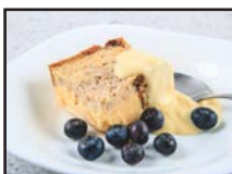
114-40 Bread & Butter Pudding with Custard