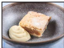
114-35 Apple Pie