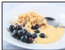
114-06 Blueberry Sponge Crumble