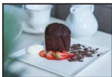
114-12 Choc Chip