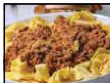
110-16 Beef Ragu Pappardelle Pappardelle pasta topped with beef ragu sauce

All our Value Meals are Australian made!