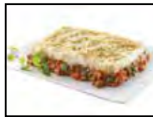
110-03 Cottage Pie

Cannelloni filled with beef bolognese & vegetables