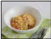
114-29 Apple & Rhubarb Crumble

Dense carrot cake with cream cheese icing