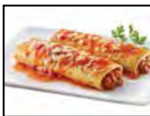
110-02 Beef Cannelloni

Cannelloni filled with beef bolognese & vegetables