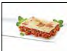
110-04 Vegetable Lasagne Vegetable lasagne topped with bechamel sauce

Minced beef & vegetables topped with mashed potato