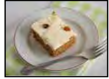
114-28 Carrot Cake

Blueberries, sponge cake & custard topped with crumble