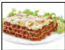
110-01 Beef Lasagne