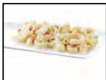
110-07 Three Cheese Macaroni Macaroni served in a cheesy sauce with smoked beef pieces