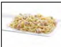
110-05 Chicken Fettuccine Chicken pieces tossed through fettuccine, served in a creamy sauce