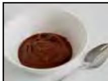
114-41 Chocolate Mousse

Pear & cinnamon crumble served with custard