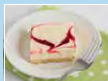
115-05 Strawberry Swirl Cheesecake