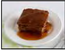
114-03 Sticky Date Pudding

Sweet and sticky date pudding with caramel sauce