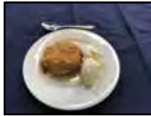
114-06 Blueberry Sponge Crumble

Sweet and sticky date pudding with caramel sauce