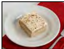
114-30 Banana Cake

Apple & rhubarb crumble served with custard