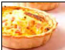
102-25 Quiche Lorraine

Ham and cheese omelette served with rice