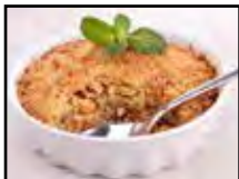
114-37 Pear & Cinnamon Crumble

Pear & cinnamon crumble served with custard