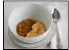
114-31 Stewed Apple & Custard

Moist banana cake with a cream cheese icing