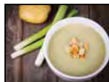
113-30 Potato & Leek

A chunky Italian tomato based soup with assorted vegetables