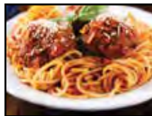
110-06 Spaghetti & Meatballs Spaghetti in a napolitana sauce, served with beef meatballs