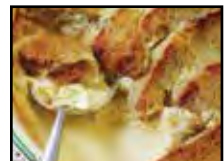
114-40 Bread & Butter Pudding

Bread & butter pudding baked with egg custard