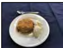
114-06 Blueberry Sponge Crumble

Sweet and sticky date pudding with caramel sauce