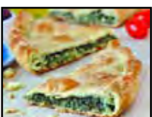
102-26 Spinach Pie

Zucchini slice with sweet potato, carrot & beans