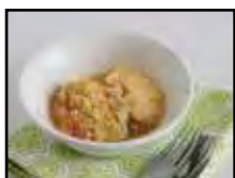
114-29 Apple & Rhubarb Crumble

Dense carrot cake with cream cheese icing