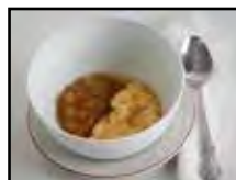
114-31 Stewed Apple & Custard

Moist banana cake with a cream cheese icing