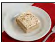
114-30 Banana Cake

Apple & rhubarb crumble served with custard