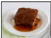
114-03 Sticky Date Pudding

Sweet and sticky date pudding with caramel sauce