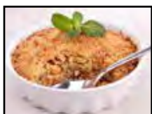
114-37 Pear & Cinnamon Crumble

Pear & cinnamon crumble served with custard