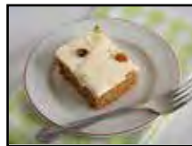
114-28 Carrot Cake

Blueberries, sponge cake & custard topped with crumble