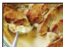
114-40 Bread & Butter Pudding

Bread & butter pudding baked with egg custard